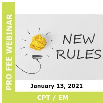
2021 E/M Changes