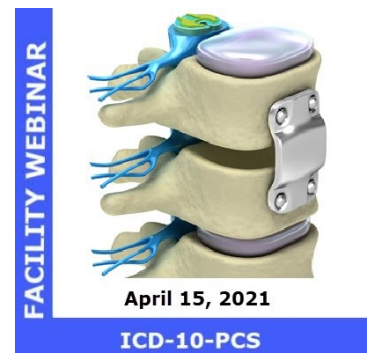
ICD-10-PCS Spinal Fusions Advanced