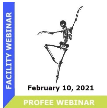
CPT Coding for Joint Replacement