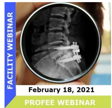
PCS Spinal Fusions Basics