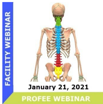
CPT/PCS Spinal Anatomy and Pathology