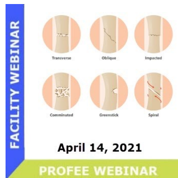
CPT Coding for Fractures