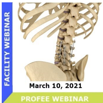
CPT Spinal Fusions: An Organized Approach to Coding