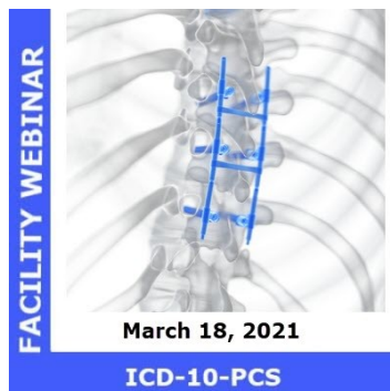
PCS Spinal Fusion Intermediate